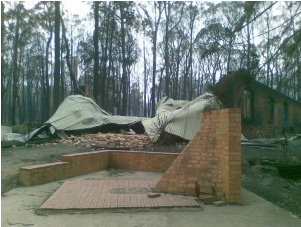
Above: Looking south east at the Kitchen / Dining facility