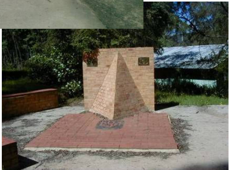
Right: The Hall can be seen in the background