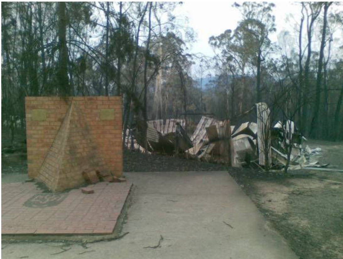
Above: Looking west towards the Hall and river. The 50 th Anniversary Monument is in the foreground

As hard as it may seem at the moment, we will rise to the challenge. We will use this opportunity to build on the passion for our beloved Karpaty – from these Ashes, a new dawn will begin.