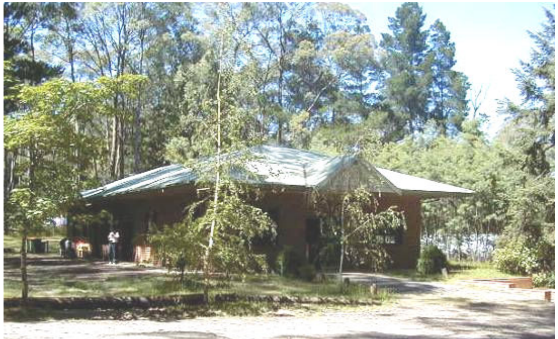
Right: The Kitchen / Dining Facility as it once was.